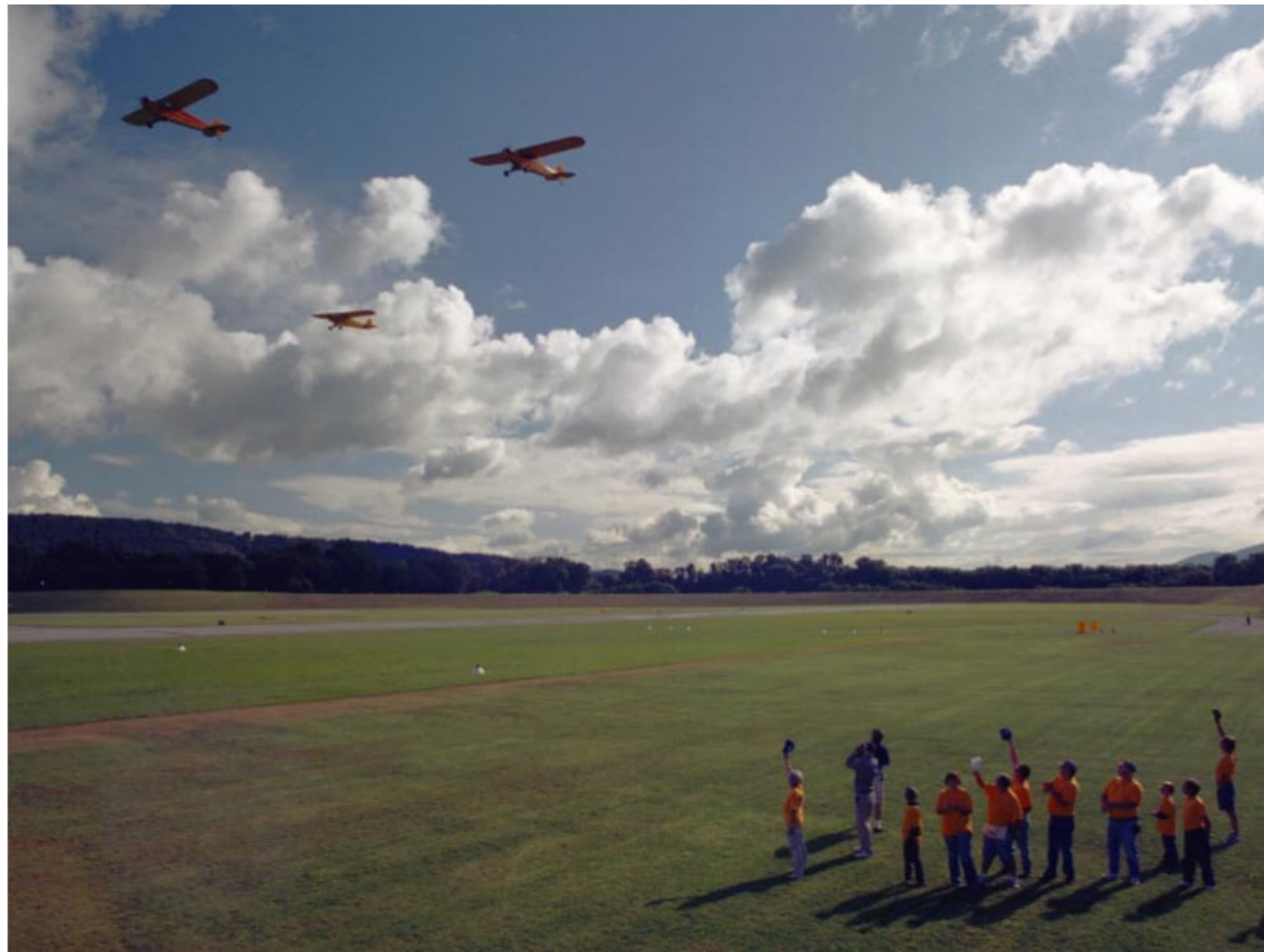
Got It! (photographer)