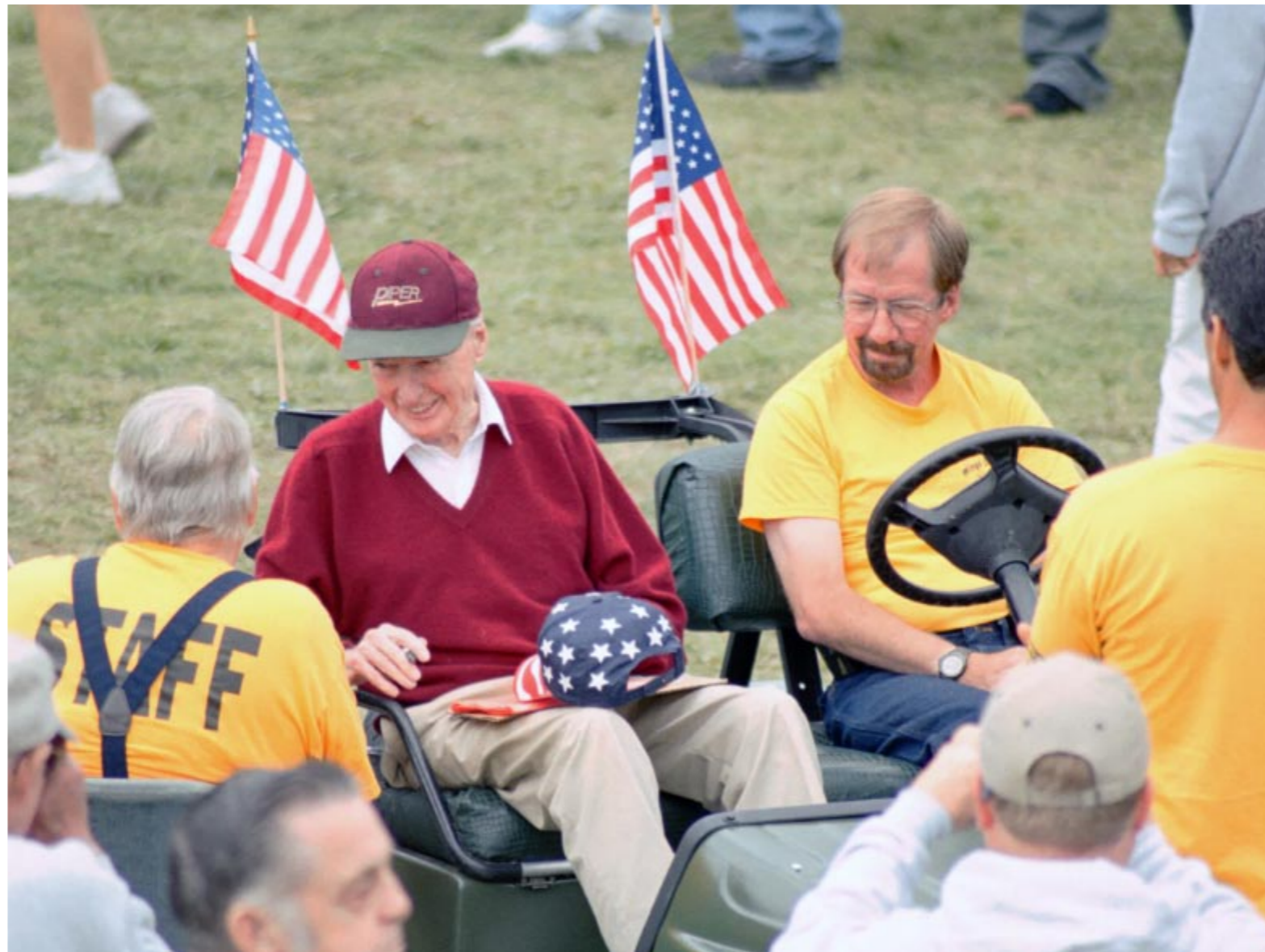
A good story