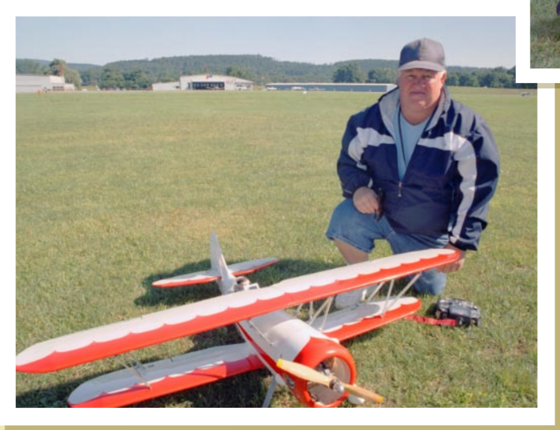
Waco Biplane